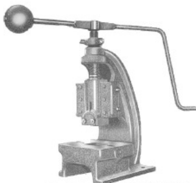
86A (Series 2) BENCH SCREW PRESS