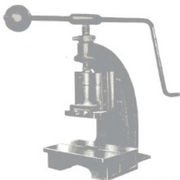
186A TOOLMAKERS DIE TRY-OUT PRESS